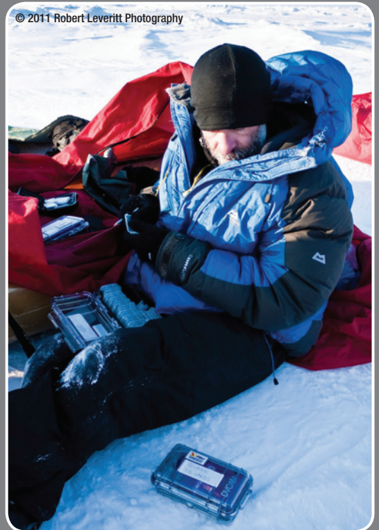
Peli MicroCases in the harsh conditions of the Polar Ice Cap.

There are seven sizes and four colours with a choice of transparent or solid coloured lid.